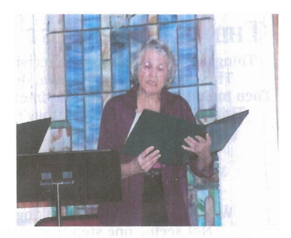
We have lost to heaven a special lady, member and servant of the Lord. She will be greatly missed but not forgotten.