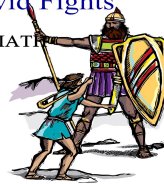
David Fights GOLIATH

PRAYER & BIBLE STUDY — We are working on lesson #21 in our Journey Series. This study is on II Corinthians chapter 11. Join us for prayer time we need our members to PRAY!